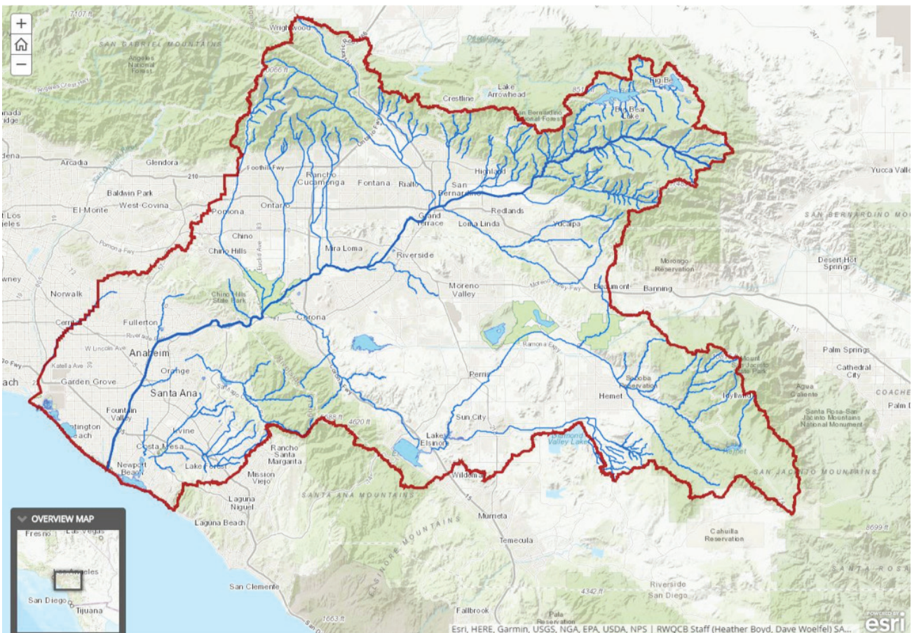
FIGURE 1: Santa Ana River Watershed boundaries

The Santa Ana River Watershed was identified as an ideal pilot location because of its advanced water governance. Water resource managers in this watershed have embraced integrated regional water management (IRWM), and SAWPA has developed a “One Water, One Watershed” (OWOW) plan to advance water management in the region and assess catchment sustainability. 1 Because of this preexisting planning process and governance structure, the catchment is well-studied and water data is relatively easily available. Facilitated engagement in the process of updating the OWOW plan, including meetings with SAWPA staff, helped companies align their targets with public sector efforts. In situations and catchments where public sector management is less robust, companies may need to seek data and information from academics and consultants, or compile data independently to inform the target-setting process.