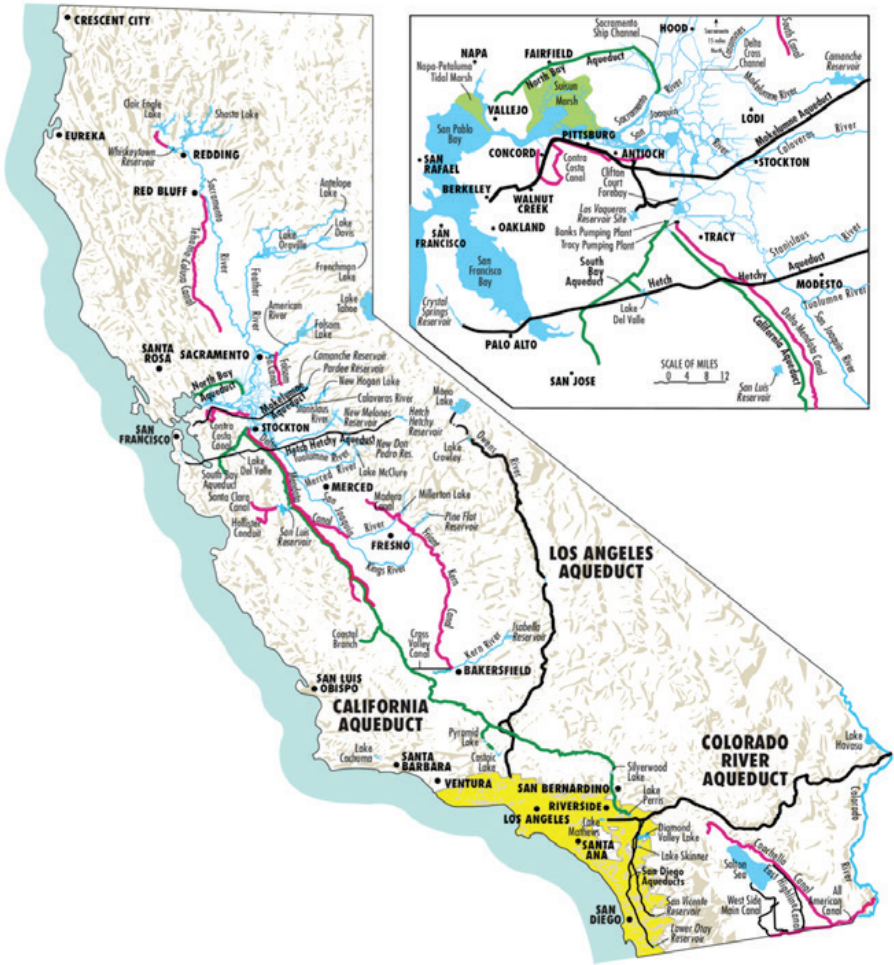
FIGURE 2: System of water imports to southern California

Water users depend not just on local surface and groundwater (50 percent of supply), but also on water imported from northern California and the Colorado River (30 percent of supply). Imported water from northern California has its source in the Sierra Nevada mountains and reaches the SARW via the State Water Project (California Aqueduct). Water coming from the east has its source in the Rocky Mountains and reaches the SARW via the Colorado River Aqueduct. See Figure 2 below for a map of imported water systems.